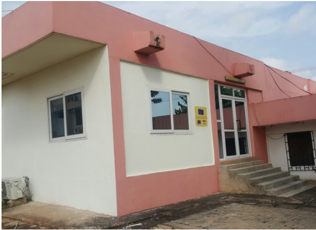
Fig. 4 Refurbished Microbiology Laboratory