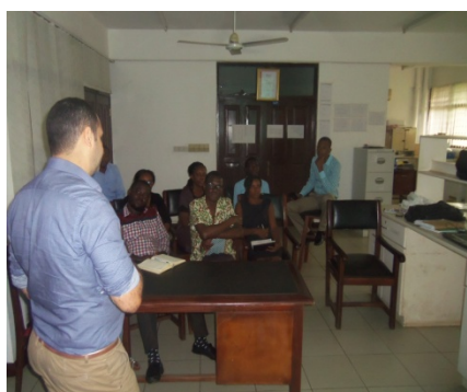
Fig. 1 Training of Staff of FRI Chemistry Laboratory

Equipment were delivered for the Chemistry, Mycotoxin, Microbiology and Mushroom Units under the TRAQUE Programme. Installation and testing on the new equipment were done by AGILENT and Globe Corporation.