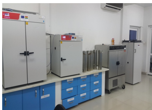
Fig. 3. Incubators donated to Microbiology Laboratory